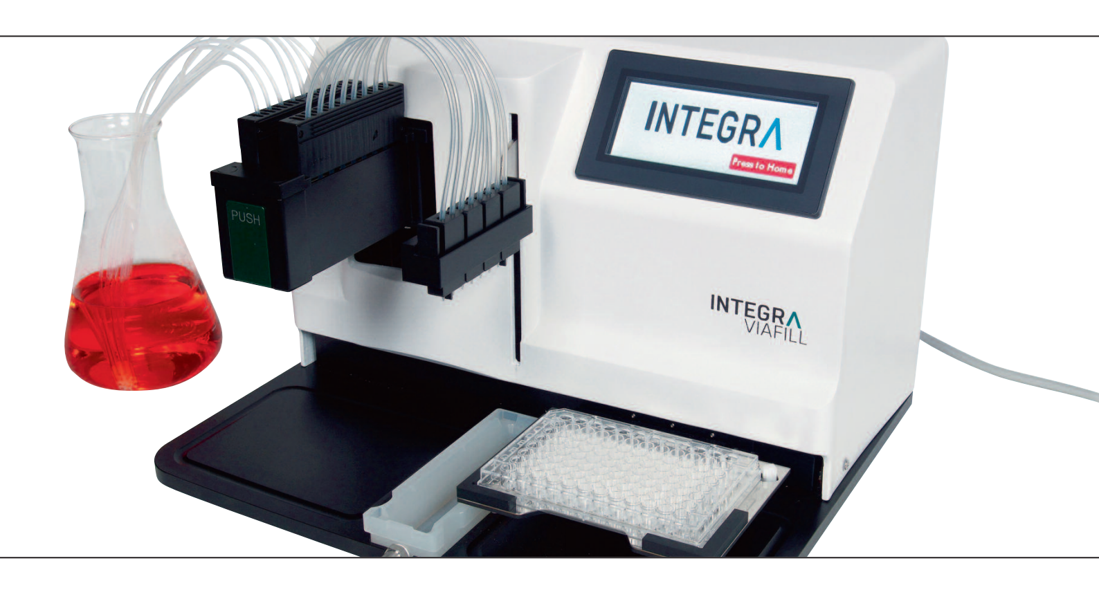
VIAFILL Easy To Use Touch Screen Rapid Reagent Dispenser